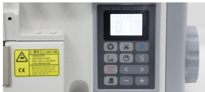
不同布料随意切换; Switching different fabrics randomly

实现多项技术革新 —— 低噪音, 高速, 线迹美观, 油量可控的清洁缝纫 Achieve multiple technological innovations Low noise, high speed, beautiful stitch, clean sewing with controllable oil volume