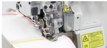
缝纫过程中速度一致, 过骨不减速, 保持平稳缝纫; without retarding when passing the seam, keep smoothly sewing